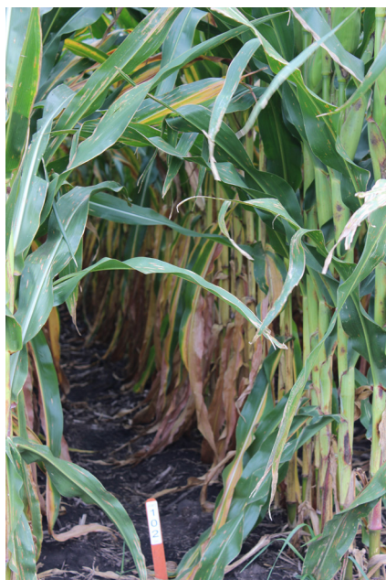
Figure 3. Nitrogen applied at growth stage V8 (image taken on August 16, 2018).