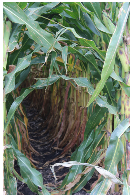
Figure 4. Nitrogen applied at growth stage VT (image taken on August 16, 2018).