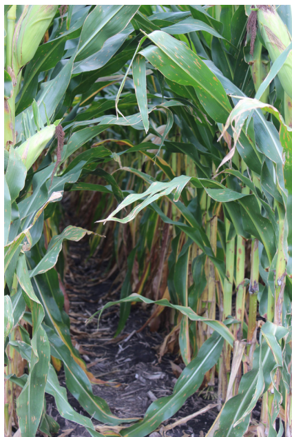
Figure 2. Nitrogen applied at growth stage V4 (image taken on August 16, 2018).