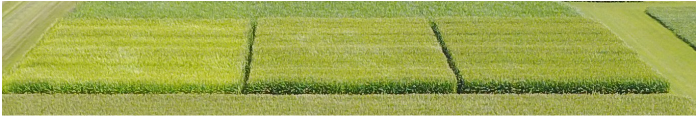
Figure 2. Nitrogen rate X Population X Hybrid, (from left to right) 0lb/acre, 60lb/acre, 240lb/acre.