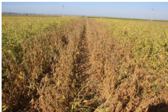
Figure 2. Image of the 2.0MG product in the +Boron fertigation treatment.