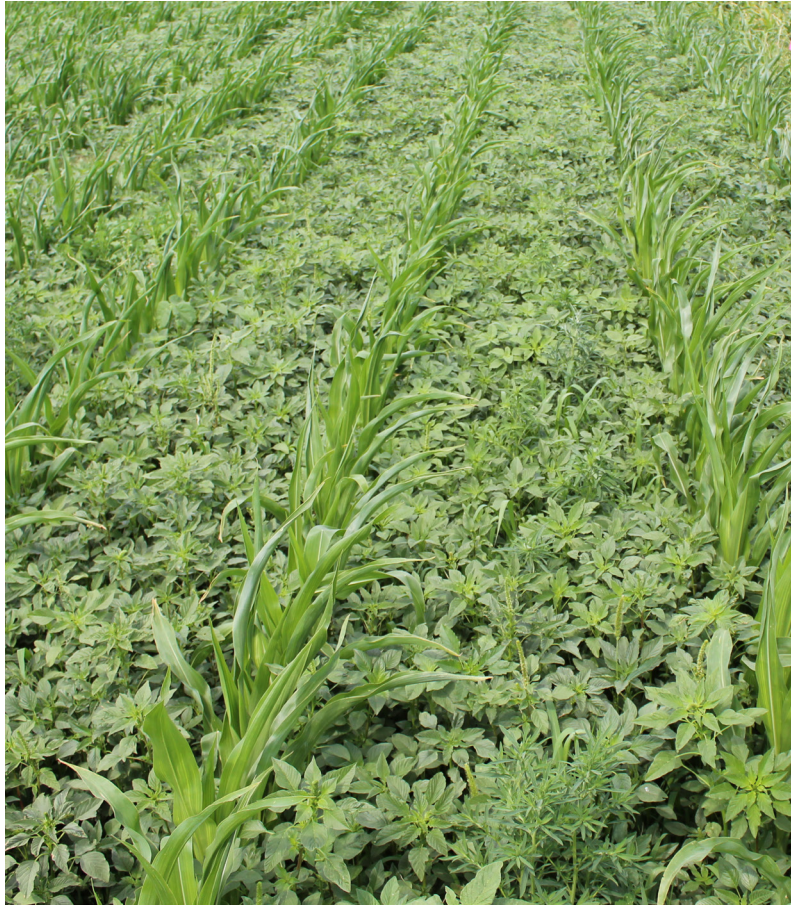
Figure 1. Non-treated plot containing Palmer amaranth and kochia.