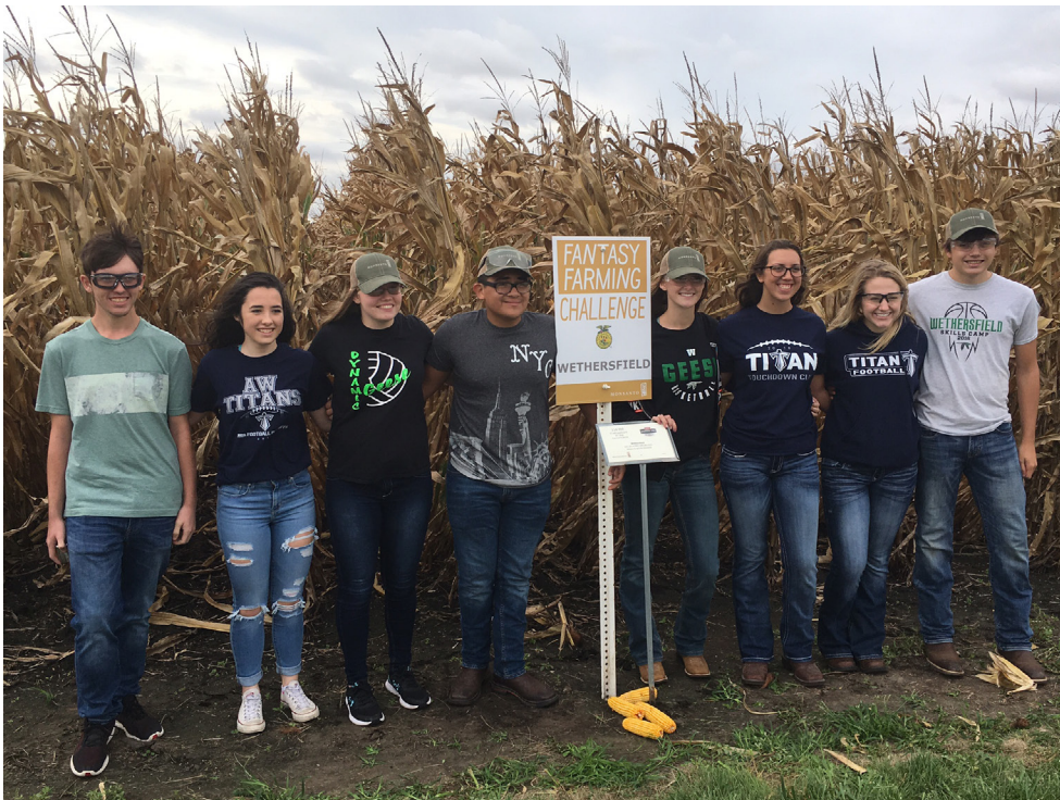
Figure 3. 2018 Fantasy Farming Challenge profitability winners from Wethersfield High School.