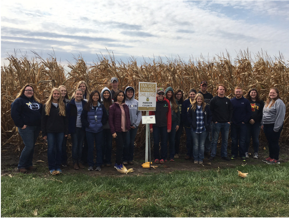
Figure 2. 2018 Fantasy Farming Challenge yield winners from Mercer County High School.