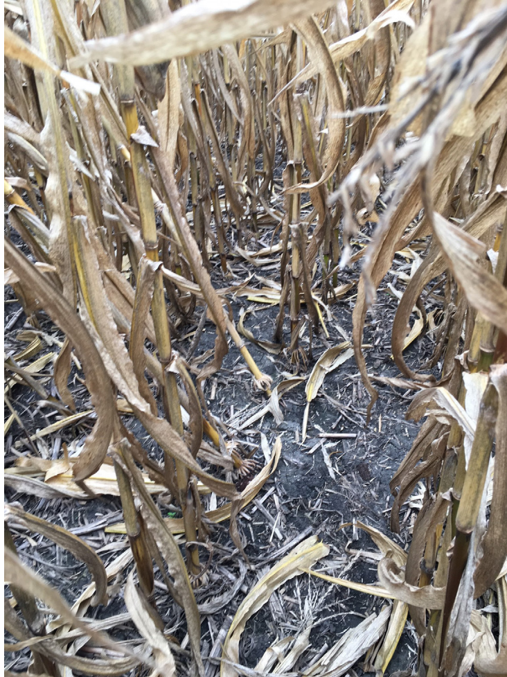
Figure 4. Corn rootworm injury in plots without corn rootworm management inputs.

Congratulations to the students at Mercer County High School in Aledo, IL for putting together the highest yielding plot! Congratulations to the students at Wethersfield High School who designed the most profitable plot! Thank you to all schools who participated, and we look forward to conducting this competition again in 2019!