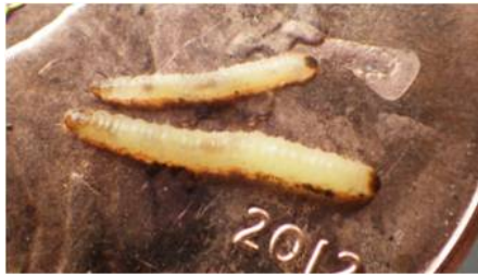
Figure 1. Corn rootworm larvae.

In all areas of the Corn Belt, production practices that favor growth in CRW populations include, continuous corn rotations, late-planted corn fields, and/or the planting of late-maturing corn products for the area. For example, full season products used by many silage growers are often prime targets for escalating CRW beetle populations because they pollinate when other desirable adult CRW food sources have deteriorated.