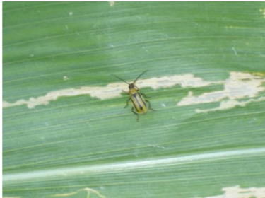
Figure 2. Western corn rootworm adult.