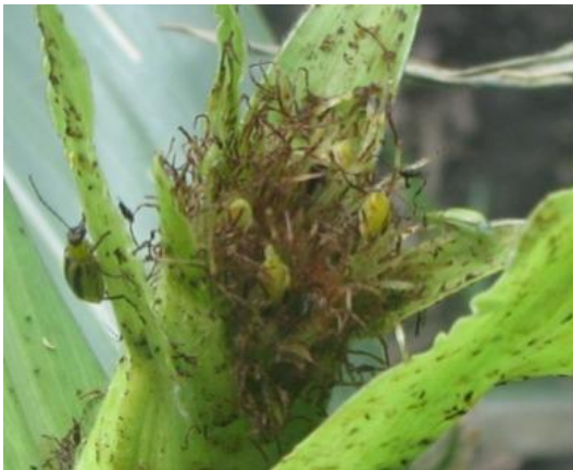
Figure 5. Adult corn rootworm beetles feeding on silks.

continuous corn operations where CRW populations are known to exist and where NCRW extended diapause variants were known to be present in a corn crop two years prior and root lodging occurred, corn products with insect protection should be considered. If non-B.t. protected corn products are planted into continuous corn situations or when extended diapause variants were known to be present in a corn crop two years prior and root lodging occurred, a soil applied insecticide (SAI) should be considered; however, SAIs may be difficult to handle, require expensive application equipment that most growers who rotate are lacking, add costs, and have been known to be inconsistent in their performance. Additionally, root digs, which normally occur in late-July are imperative to help evaluate CRW larval damage and assess CRW management strategies. The Iowa State Node-Injury Scale can be used to evaluate feeding damage ( www.ent.iastate.edu ). 5 Weeds and volunteer corn should be managed in soybean fields as pollinating weeds and corn can attract CRW beetles.