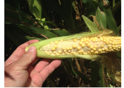
Figure 6. Poor kernel set as a result of silk damage caused by corn rootworm.

Scout and Protect Silks - Adult CRW populations should be monitored around tasseling to determine if adult control measures are warranted to protect silks from clipping (Figure 5). Silk clipping can prevent ovule fertilization, which results in aborted kernels (Figure 6). In some regions, the economic threshold of five beetles/plant may justify a foliar insecticide application to protect silks. 4 University guidelines should be followed for the thresholds. Adult scouting can also help determine the potential for infestation in future corn crops.