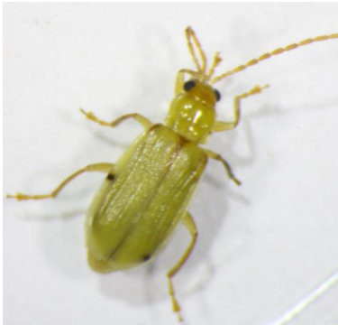
Figure 1. Northern corn rootworm adult.

The Northern corn rootworm ( Diabrotica barberi Smith & Lawrence) (NCRW) and the Western corn rootworm ( Diabrotica virgifera virgifera LeConte) (WCRW) are the prominent corn rootworm (CRW) pests in the Midwestern states. The NCRW adult is cream to tan in color upon emergence, but turns to pale green and is about 1/4 inch long (Figure 1). The WCRW adult is yellow to green in color, has black stripes on the wing covers, and is about 5/16 inch long (Figure 2). 1 The male's stripes usually appear wider and may coalesce. The females of the two species are generally larger than the males.