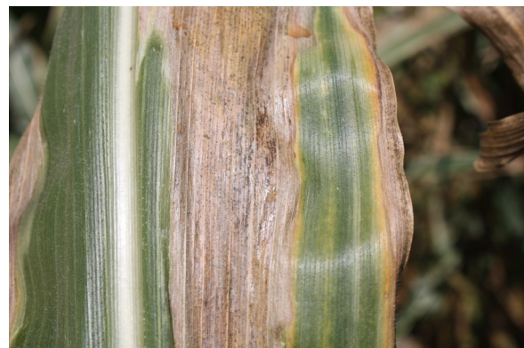
Figure 1. Leaf blight symptoms with freckles.

Infection Sources. The bacterium Clavibacter michiganensis subsp. nebraskensis , overwinters in crop residue and enters plants through wounds created by injuries from wind, sand, or hail. The disease can spread from one field to another through displacement of crop residue. Within fields, initial infection can occur as rain or irrigation water splashes bacteria from infected crop residue onto corn plants.