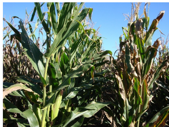
Figure 3. Comparison of corn products tolerant (left) and susceptible (right) to Goss's Wilt.

In summary, Goss's Wilt has the potential to be a difficult disease to control in-season. Significant loss of yield potential may occur during seasons with favorable environmental conditions. Corn products should be selected to tolerate Goss's Wilt where there has been a history of this disease.